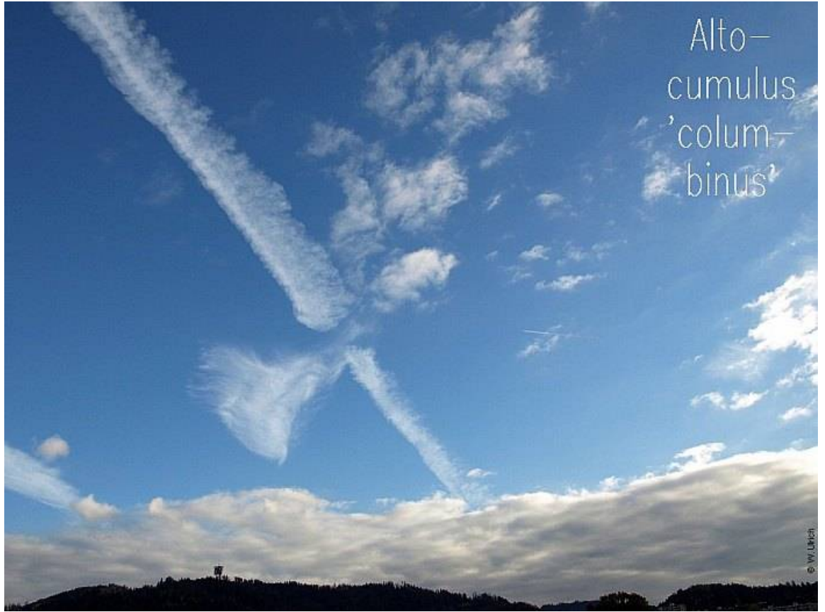
Altocumulus and contrail combine to form a sky dove of rare perfection and size

„Clouds are Nature’s poetry, and the most egalitarian of her displays, since everyone can have a fantastic view of them.”